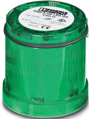
LED permanent light element, 24 V AC/DC, green

Please be informed that the data shown in this PDF Document is generated from our Online Catalog. Please find the complete data in the user's documentation. Our General Terms of Use for Downloads are valid ( http://phoenixcontact.com/download )